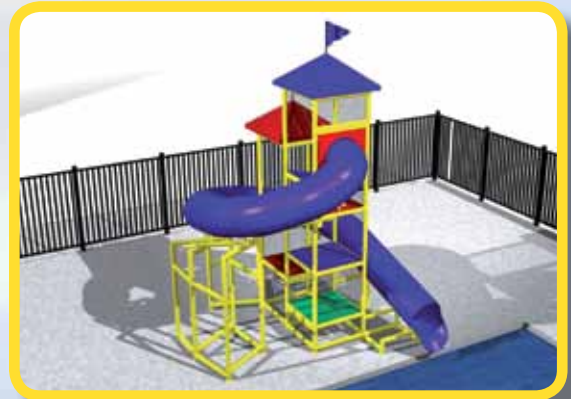
Slide System 205 46' Flume - 12' Deck HT.