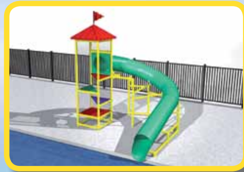
Slide System 108 33' Flume - 8' Deck HT.