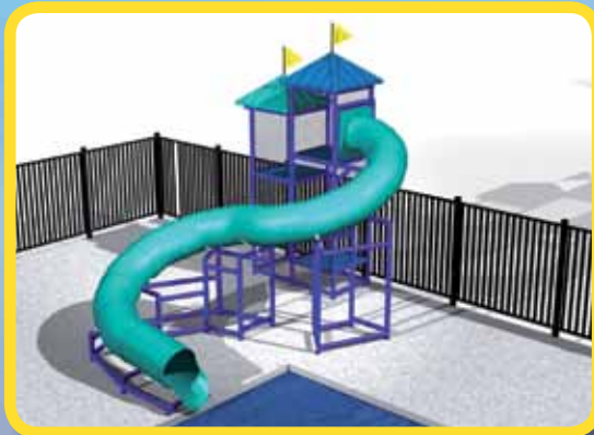
Slide System 204 45' Flume - 10' Deck HT.