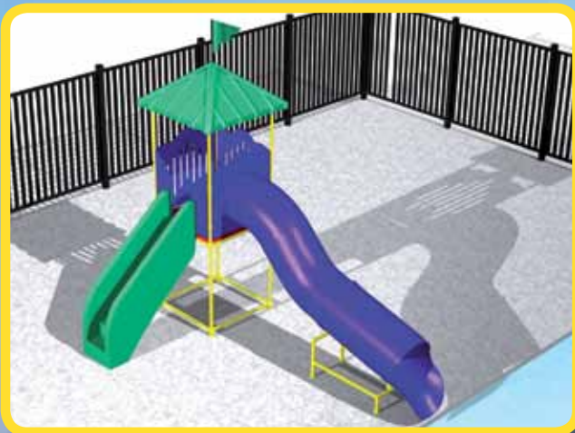
Slide System SI 1 12' Flume - 5' Deck HT.

If you are looking for an affordable means to boost memberships or paid receipts, or simply upgrade your existing pool, add a water slide from Small Water Slides. These affordable commercial grade water slides provide fun for all ages. Colorful and highly visible, your pool will have a fresh new look that will last for years.