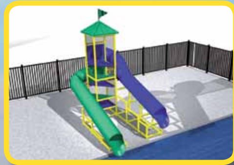
Slide System 107 24' Flume - 6' Deck HT. 25' Flume - 10' Deck HT.