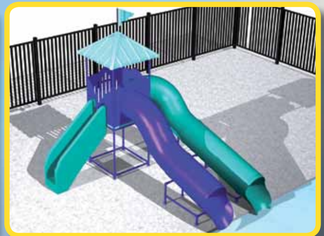
Slide System SI 2 12' Flume - 5' Deck HT. 14' Flume - 5' Deck HT.