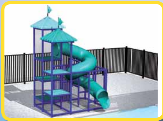
Slide System 203 29' Flume - 10' Deck HT.