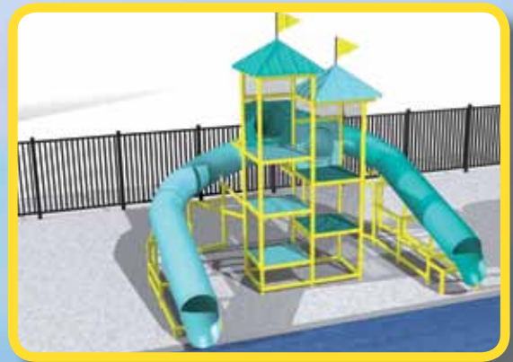
Slide System 206 33' Flume - 8' Deck HT. 36' Flume - 10' Deck HT.