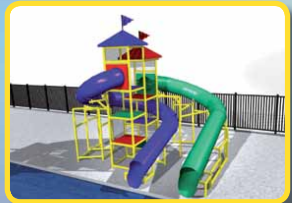
Slide System 207 35' Flume - 10' Deck HT. 46' Flume - 12' Deck HT.