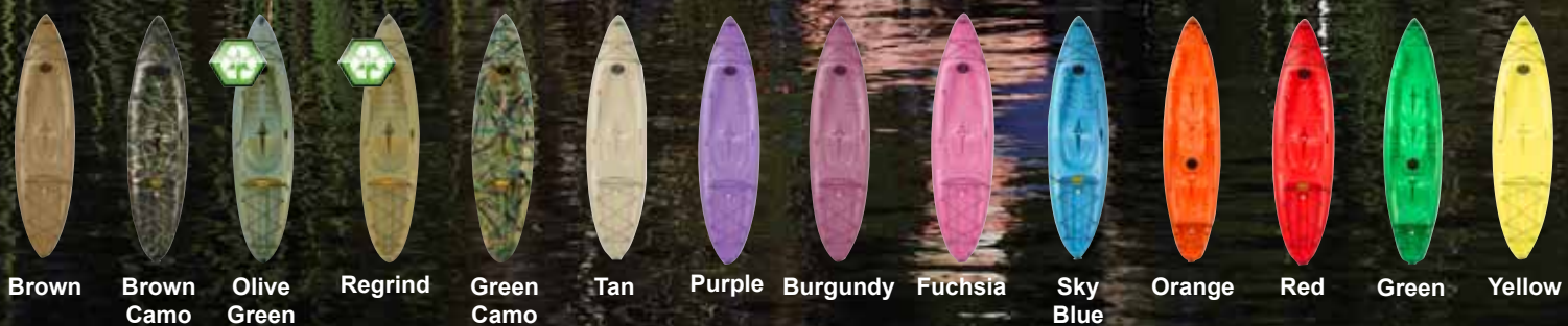
Brown Brown Camo Olive Green Regrind Green Camo Tan Purple Burgundy Fuchsia Sky Blue Orange Red Green Yellow

All colors are in granite and available on all models There are fourteen colors to choose from