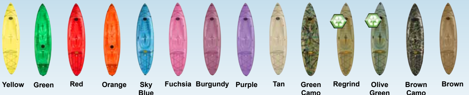
Yellow Green Red Orange Sky Blue Fuchsia Burgundy Purple Tan Green Camo Regrind Olive Green Brown Camo Brown

There are fourteen colors to choose from